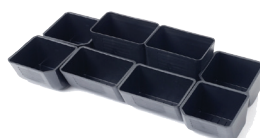
Tellercup Coin Cups